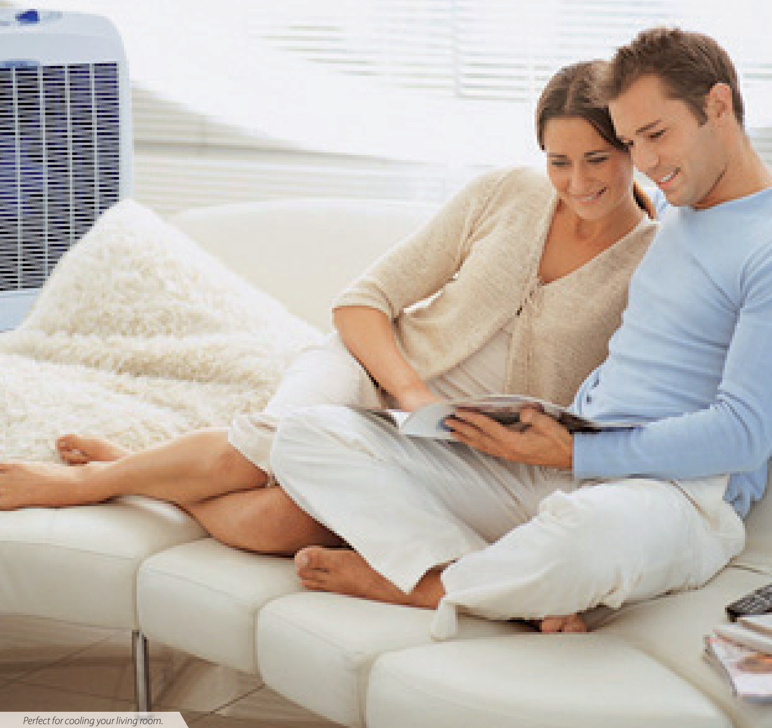
Perfect for cooling your living room.

Convair evaporative air conditioners contain no harmful CFC gases and provide cooling that is refreshingly clean. Air is drawn into the unit and cooled naturally as it passes through water soaked pads. Nothing could be simpler, cleaner or healthier.