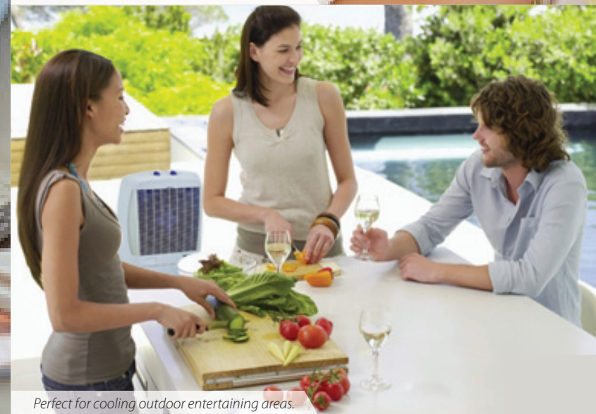
Perfect for cooling outdoor entertaining areas.